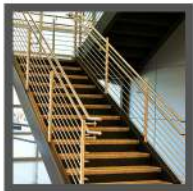
Fabrication (S.S, M.S and Aluminum works)