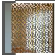
Partition and Decorative Metal Works