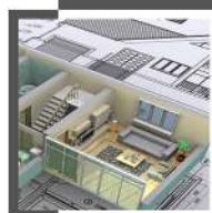
Structural Design & Calculations

Our success is directly linked to the confidence of our satisfied customers, efficiency of our suppliers and dedication of our staffs who are all well experienced and trained. The quality and service we provide continue bring us to be on top.