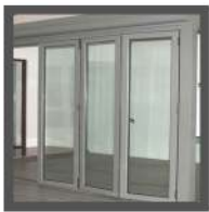
Manufacturing (S.S, M.S and Aluminum works)

AL FALAH ENGINEERING WORKS continue to move forward to the highest level of competition. As our activities and services includes: