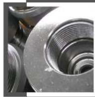
Color Plating Works